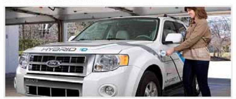
Ford Motor Company

Ford Motor Company closed a $5.9 billion loan arrangement under the Department of Energy's Advanced Technology Vehicles Manufacturing Loan Program to upgrade factories across Illinois, Kentucky, Michigan, Missouri, and Ohio and to introduce new technologies that will raise the fuel efficiency of more than a dozen popular vehicles. The project will convert nearly 33,000 employees to green manufacturing jobs.